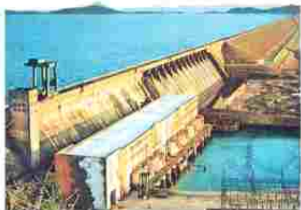
Fig. 3.2: Hirakud Dam

What are dams and how do they help us in conserving and managing water? Dams were traditionally built to impound rivers and rainwater that could be used later to irrigate agricultural fields. Today, dams are built not just for irrigation but for electricity generation, water supply for domestic and industrial uses, flood control, recreation, inland navigation and fish breeding. Hence, dams are now referred to as multi-purpose projects where the many uses of the impounded water are integrated with one another. For example, in the Sutluj-Beas river basin, the Bhakra - Nangal project water is being used both for hydel power production and irrigation. Similarly, the Hirakud project in the Mahanadi basin integrates conservation of water with flood control.