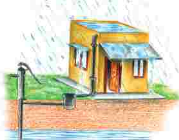
(a) Recharge through Hand Pump

system and were built inside the main house or the courtyard. They were connected to the sloping roofs of the houses through a pipe. Rain falling on the rooftops would travel down the pipe and was stored in these underground 'tankas'. The first spell of rain was usually not collected as this would clean the roofs and the pipes. The rainwater from the subsequent showers was then collected.