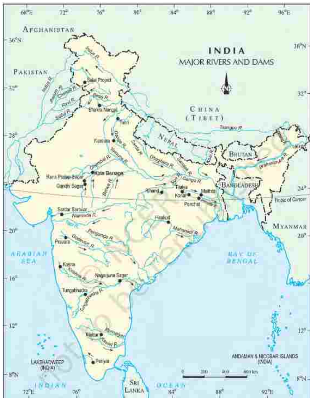
India: Major Rivers and Dams