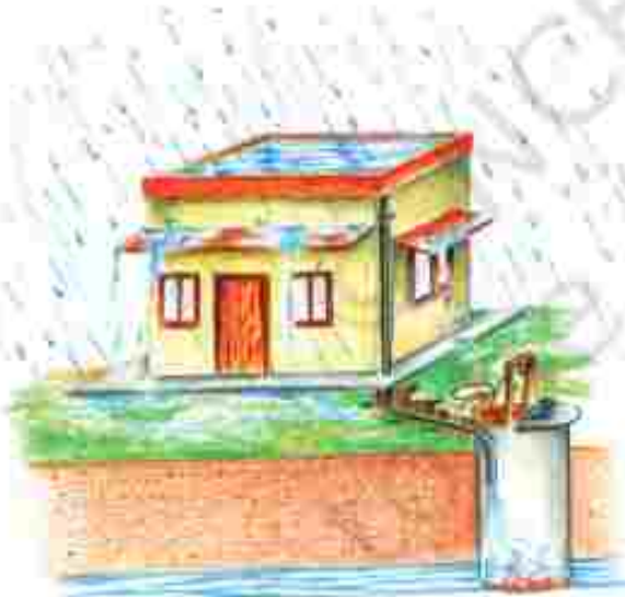
(b) Recharge through Abandoned Dugwell